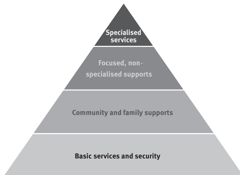
Figure 1: Intervention pyramid for mental health and psychosocial support in emergencies (IASC 2007, 12).

At a practical level, four broad categories or types of interventions that could improve the psychosocial well-being of those in the midst of humanitarian and political emergencies have been identified. These can be thought of as a pyramid (see Figure 1 ). Needs listed at the bottom of the pyramid require the most intervention, and those identified thereafter need progressively less, although all layers are important and require implementation concurrently (IASC 2007). The most extensive task, according to the IASC Guidelines on Mental Health and Psychosocial Support in Emergency Settings , is to (re)establish security, adequate governance and services that address basic physical needs (food, water, basic health care, control of communicable diseases, etc.). Secondly, help needs to be offered in accessing key community and family support (family tracing and reunification, assisted mourning and communal healing ceremonies, etc.). Thirdly, non-specialised supports (these can include emotional and livelihood support) for the still smaller number of people who additionally require more focused individual, family or group interventions by trained and supervised workers should be ensured. Finally, the specialised services of psychologists, psychiatrists or other trained individuals should be offered to people with severe mental disorders whenever their needs exceed the capacities of existing primary/general health services (IASC 2007).