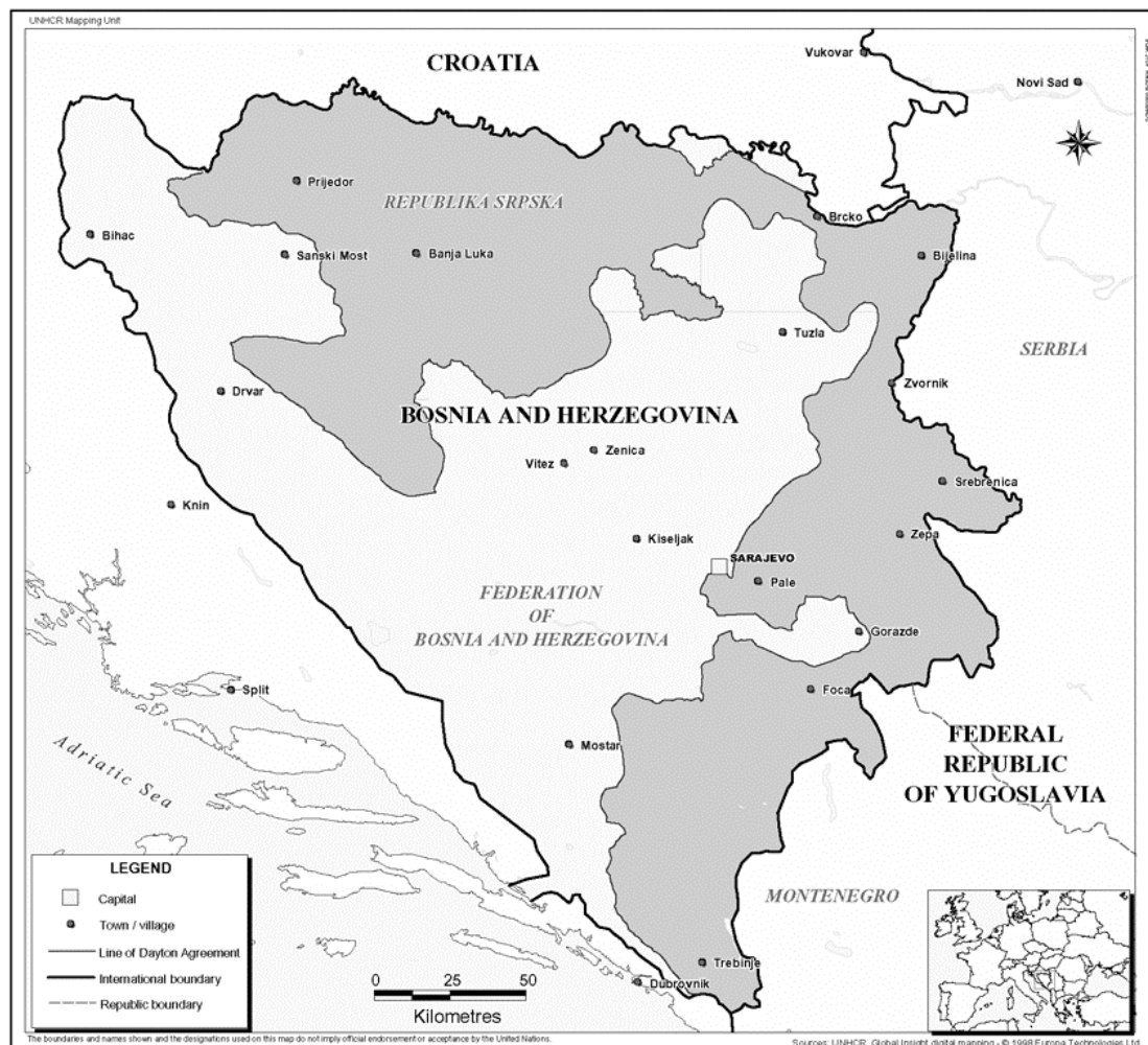
Figure 2 : The 1995 Dayton Agreement for Bosnia and Herzegovina